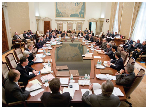
Federal Open Market Committee

Armed with this book, you have now been assigned the task of finding the largest committee where everyone disagrees. However, finding a large committee can prove challenging; careful analysis have revealed that for any non-empty group of party members, there is always at least one member of the group who disagrees with (strictly) less than K of the other group members. Obviously, then, the committee can not have more than K members. But is there a choice of committee of this size? Find the size of a largest possible committee such that nobody in that committee agrees.